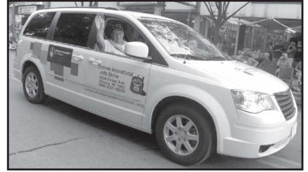
Erie & Philadelphia for Orthopaedic Care Cincinnati for Burns All Drivers are Volunteers DRIVERS ARE ALWAYS NEEDED!!

We Drive to Shrine Hospitals so Children Can Walk