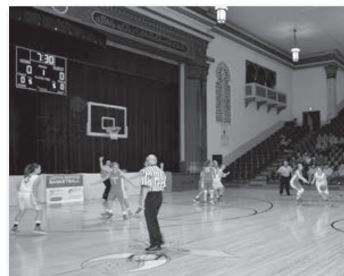
Bishop McCort vs. Bellwood.