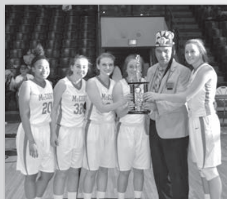
Tournament runner-up Bishop McCort.