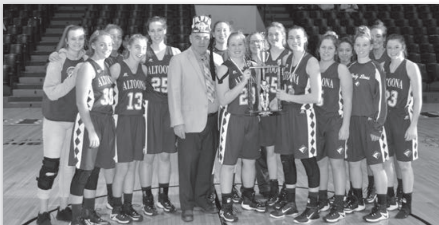
Tournament champion Altoona.