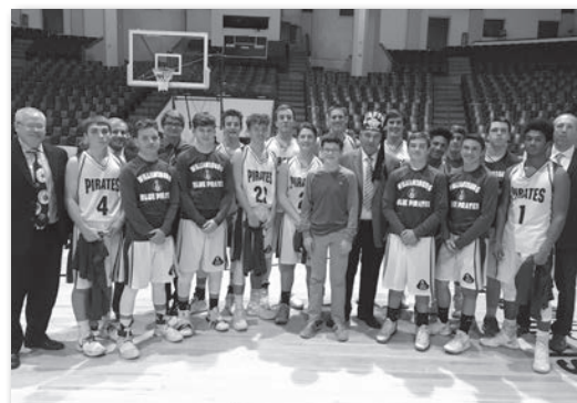
Tip-off team Williamsburg.