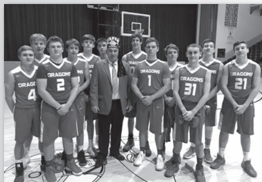
Tip-off team Central.