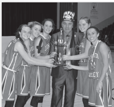
Tournament runner-up Juniata Valley.