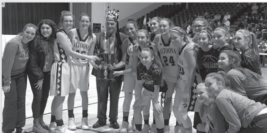
Tournament champion Altoona.